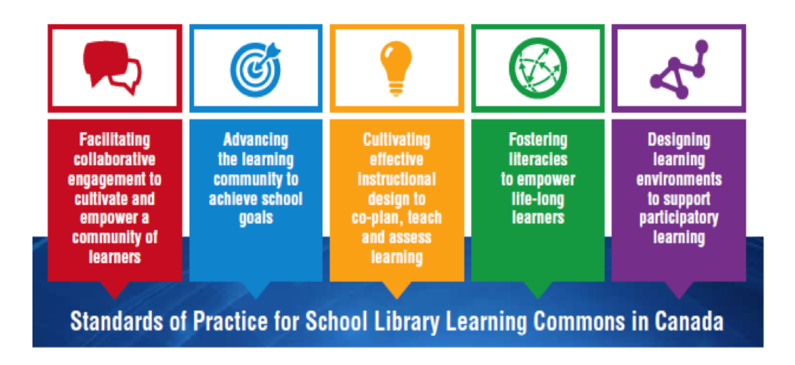
Figure 1: Standards of Practice for School Library Learning Commons in Canada. Canadian Library Association, 2014b, figure, page 8, and definitions, page 11, 13, 15, 17 & 19