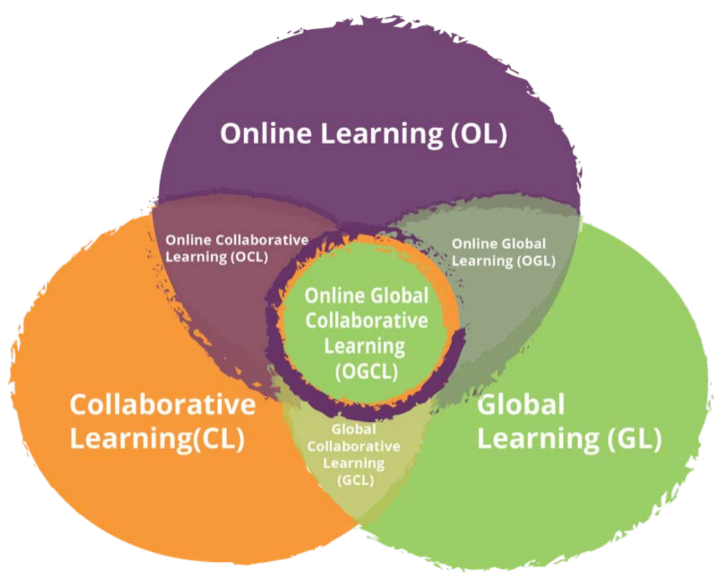
Figure 2: The Online Global Collaborative Learning (OGCL) Construct

In OGCL the educator has equal responsibility along with the student (where applicable, and scaffolded according to age) to forge online collaborative learning relationships and to self-direct, personalise and determine the learning. The OGCL construct is pertinent to K-12 global collaboration and applicable to similar collaborations between students, educators and classes at the higher education level, utilising the technology for cognitive learning through application of different pedagogical objectives (Ertmer & Ottenbreit-Leftwich, 2013; Jonassen, Carr & Yueh, 1998).